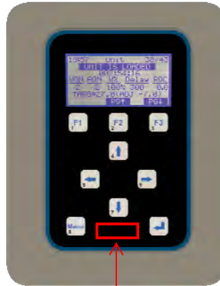
RS232 PORT REMOVED

A PC can now be connected to the RS485 port on the back of the MCS-MAGNUM keypad or on the MCS-MAGNUM's motherboard RS485 port utilizing a MCS-USB-RS485 cable as shown here to the right.